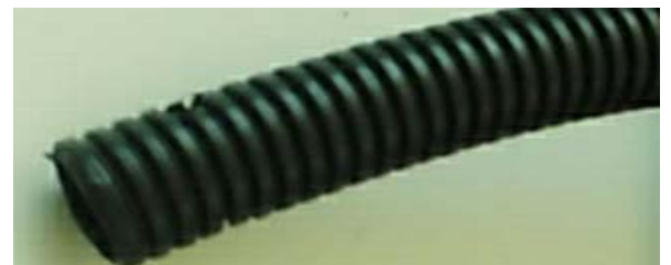
Protection side B