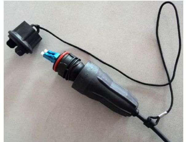
Protection side A

This is armored fiber optic patch cord with 2 fibers, which is designed ideal for CPRI cabling system.